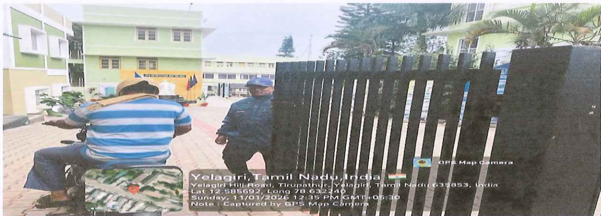
Security Checkpoint at the College Main Gate