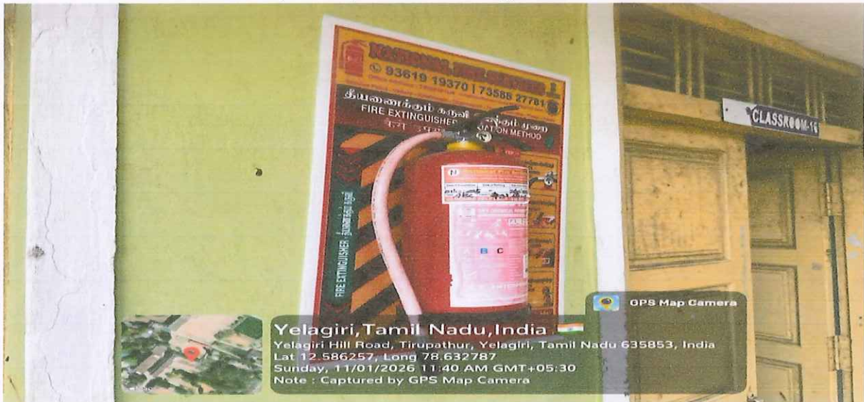
Fire Extinguisher Located at Strategic Points