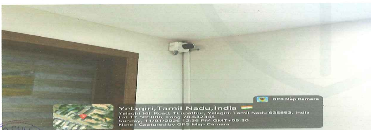
CCTV surveillance systems