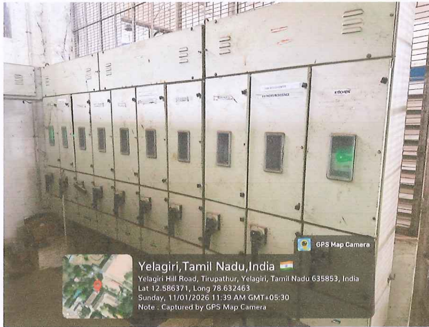
Electrical Grid Power Supply Connection