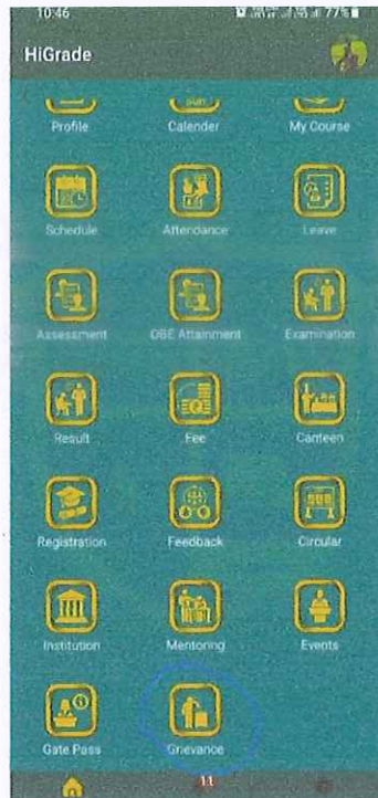
Student Grievance Menu from the ERP-Software (Higrade Mobile App)