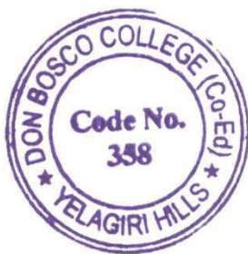
Head of the Department