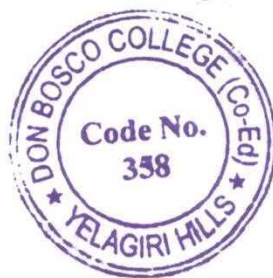
Head of the Department