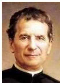
SAINT JOHN BOSCO , popularly known as Don Bosco, was born at Becchi, in Piedmont,